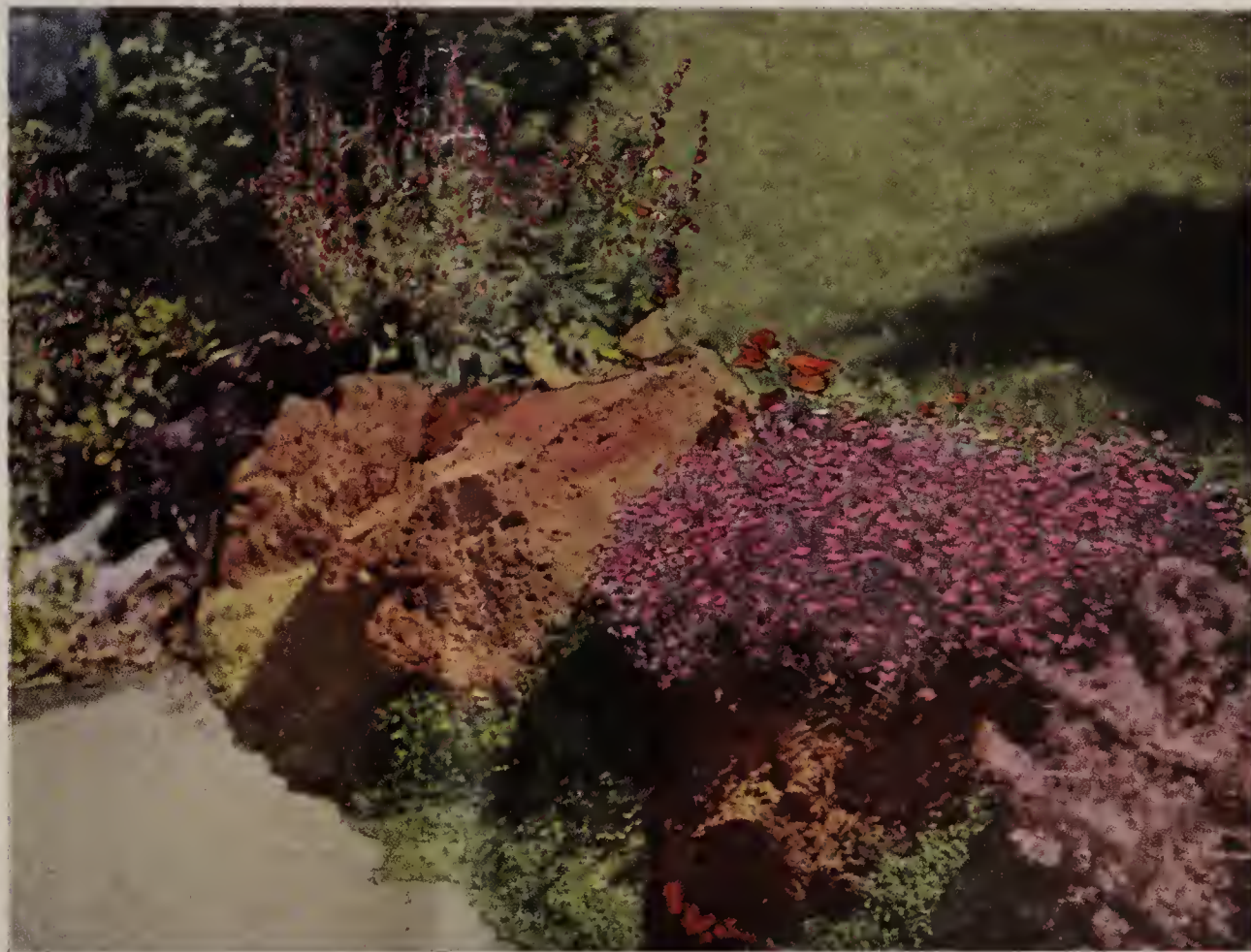
Effective demarkation between path and sloping lawn.

The rock garden pictured here is the result of such continued interest and loving care. Such a garden is one of living interest every day of every year.